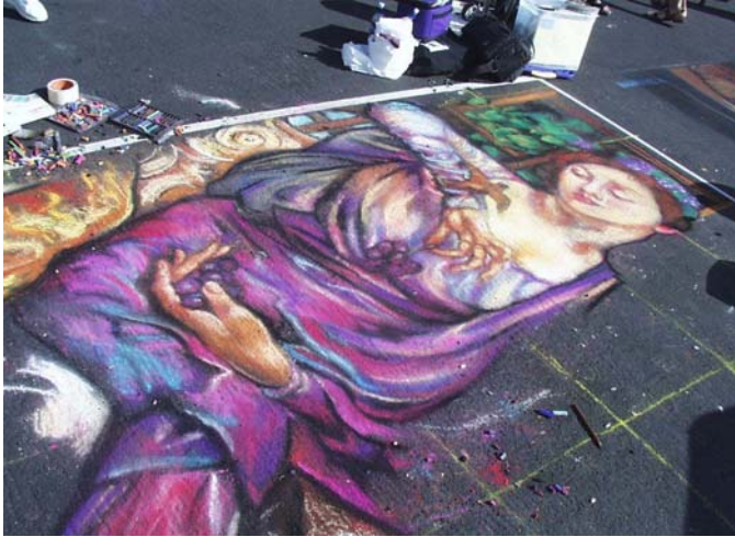
Above: An artist works on a portrait of the Madonna. "Avenida de Colores" a street festival celebrating chalk based art, will be held in Sarasota beginning May 2.